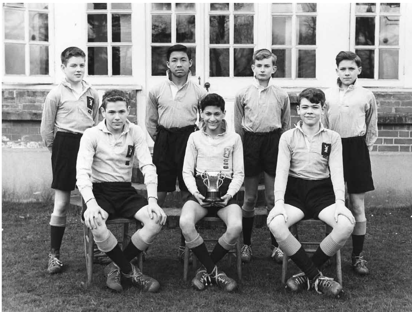
Winning 1958 Sevens Team