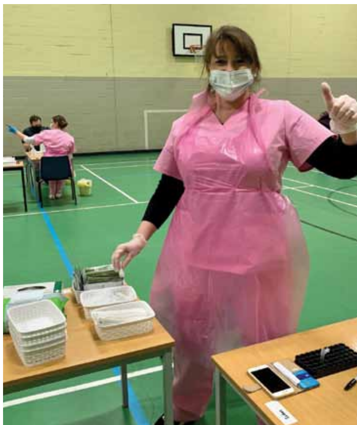
50 or so staff all tested for Covid-19 at the start of the Lent Term in the Sports Hall and we were all negative.