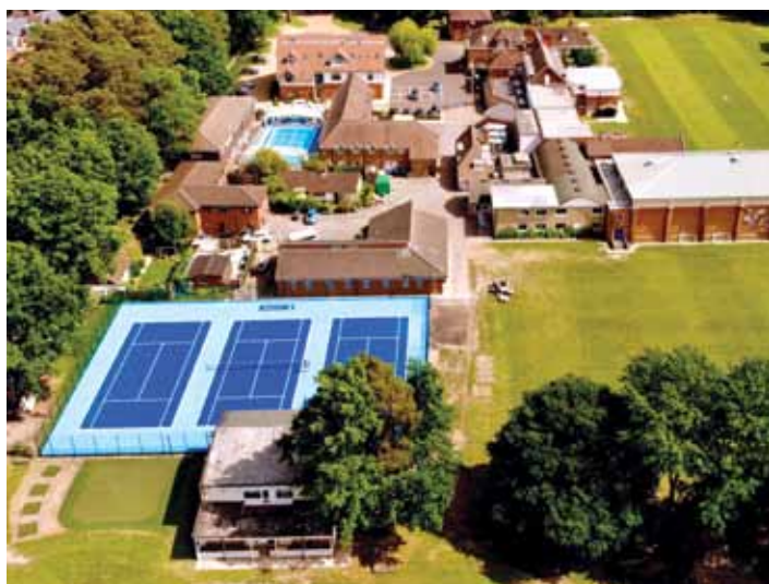
New Tennis Courts, installed in 2020