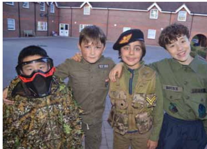
Dayboys in camouflage outfits at their annual sleepover in the dorms in February 2020

After the last two incredibly successful seasons in football and rugby enjoyed by Papplewick it would be no surprise if there were quite a few schools who would have wanted to enter the prep school transfer market this year, if such a thing existed, to get their hands on our players. With the round ball, there were outstanding results across the board including the 1st XI