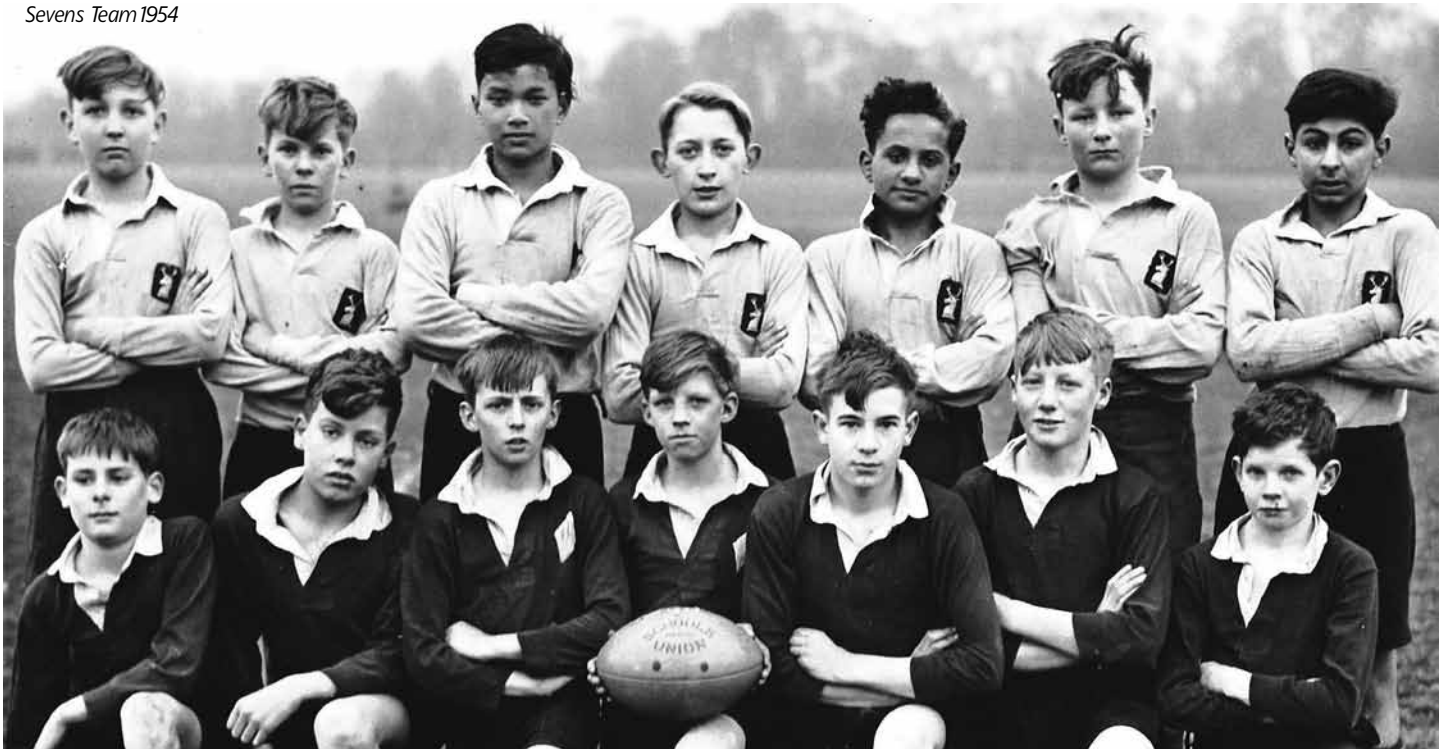
Sevens Team 1954