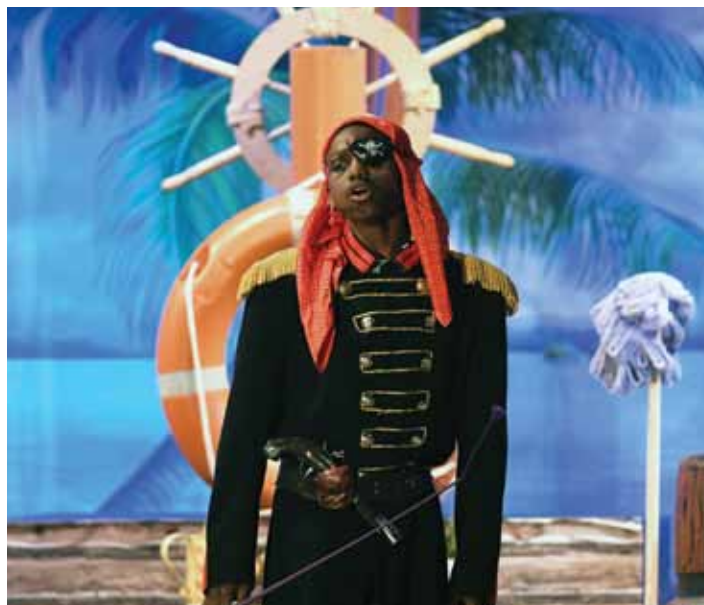
Treasure Island – the School Play in December 2019

This slideshow was followed rapidly by what the Headmaster assured us was the moment we had all been waiting for; "it's time for the Papplewick Big Sing - an incredible project put together by our musical staff and technician, with over 190 videos of singing submitted by individual boys and staff, which