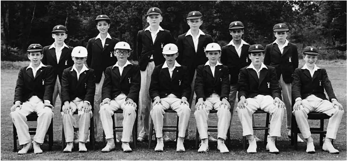
Cricket Team 1959, many of whom could well be at the Reunion at Papplewick on July 11th this year