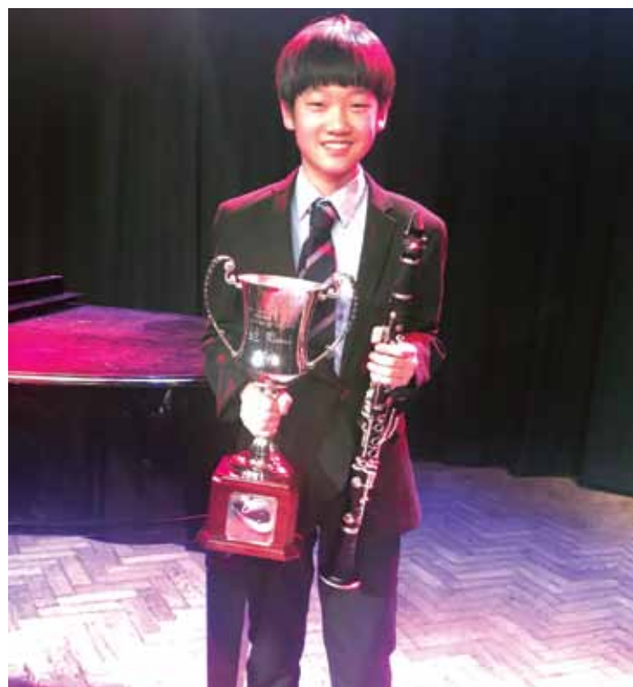
Berkshire Young Musician of the Year 2020

"So well done the boys. I do believe, though, that this year they have benefited more than usual from the enthusiasm, the inspiration, the commitment, and above all the care of the rather exceptional team who make up the Papplewick staff whether as teachers or non-teachers. 'Care' is actually at the root of the motivation of our staff, and it is this care that has driven them to deliver the remote programme in the manner that they have done throughout the term. I have received so many complimentary emails from parents on this subject, and I would like to express my own thanks to these parents for their