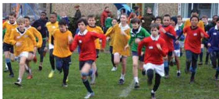
St. George's triumph in the annual House Cross-Country race in the hideous rain and mud of the 2020 Cross-country last January

Equipment, tree stumps, tree trunks and the like were loaded on to and transported on The Trolley, which was a four wheel truck with a 'D' handle to pull it and steerable front wheels. The boys had great fun with this vehicle. If you sat at the front of the flat-bed of The Trolley holding the 'D' handle almost